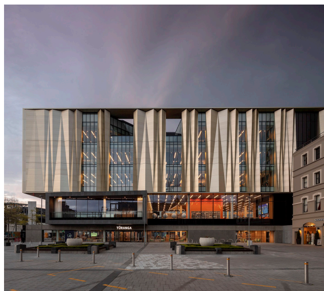
Tūranga by Architectus and Schmidt Hammer Lassen Architects