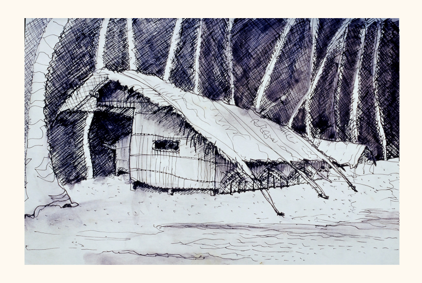
Leo's House, Nimoa Island, Louisiade archipelago, Papua New Guinea. Drawing by David Mitchell, 1993