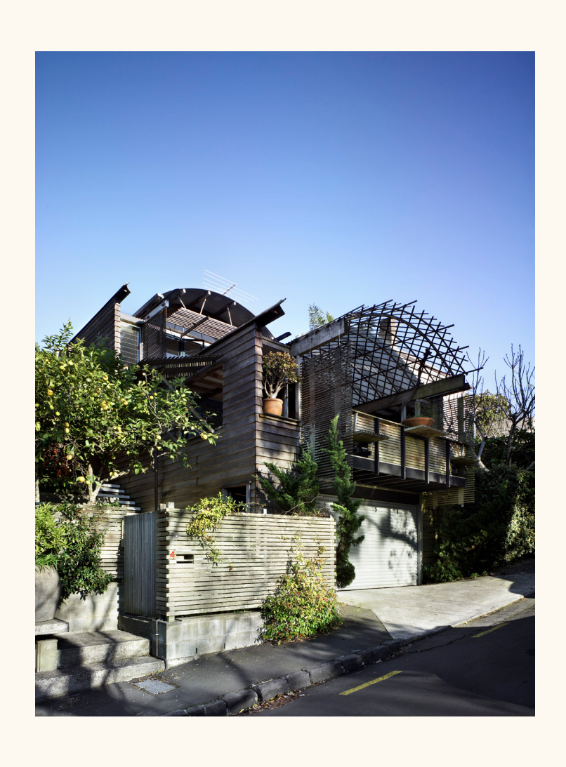
Mitchell-Stout House (1990), Freemans Bay, Auckland.