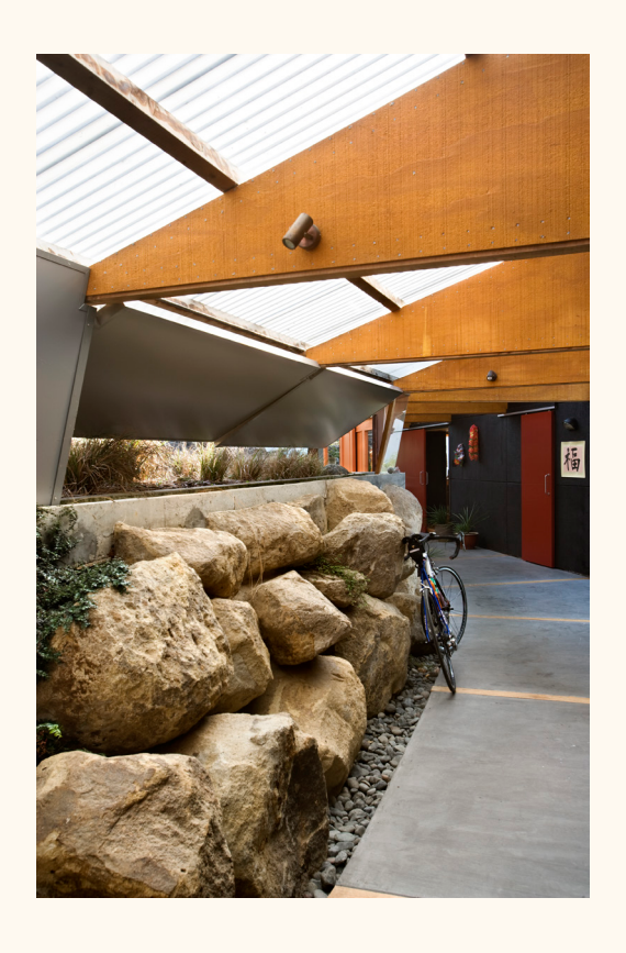
Otoparae House (2005), King Country.